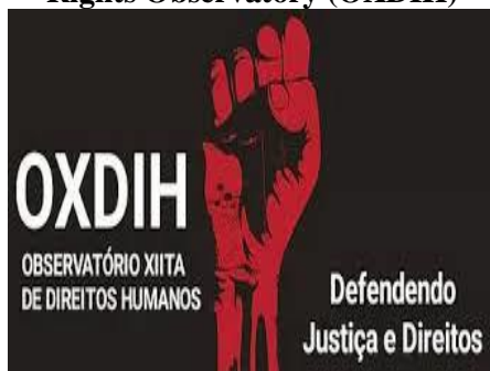
Fig. 1: The Shiite Human Rights Observatory (OXDIH)