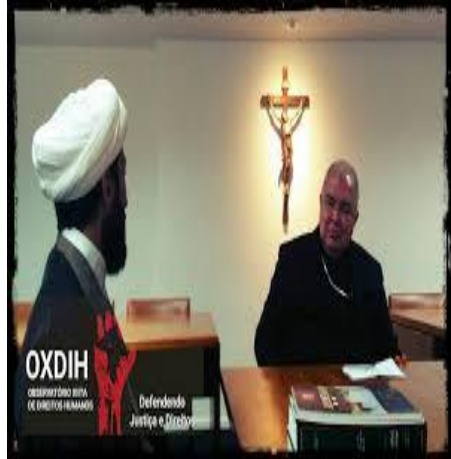
Fig. 2: Religious leaders promoting dialogue for peace in Brazil